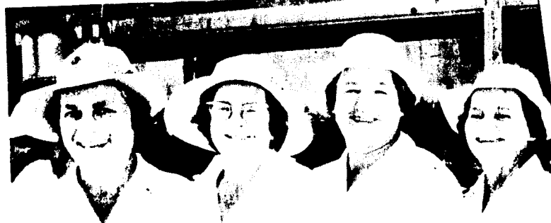
CORINDA LADIES' BOWLING CLUB